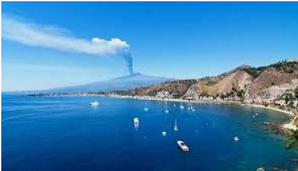
View of the bay of Giardini Naxos south side with Etna in the background

It is ranked among the top Italian tourist cities for its natural beauty and its cultural and culinary attractions, famous for its golden beaches equipped with all the tourist services that intersect with the volcanic rock of Etna.